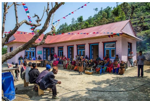
Inauguration of the dispensary (May 2013)

ANUVAM succeeded in having a bridge built over the river to open up the village. In addition to these concrete achievements cultural activities, publications on the traditions of the Khaling Rai ethnic group and the organisation of solidarity trekking tours.