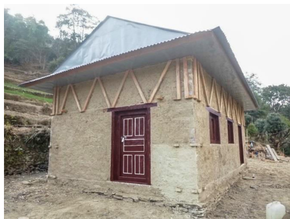
Earthquake-resistant house built in December 2020

During the winters of 2018-19, 2019-20 and 2020-21 , eight other houses were built, with the help of Nepalese master builders, for families who had previously been living in huts. ANUVAM provided financial assistance of €6,000 per house in partnership with the CDC développement solidaire ii association, which made a contribution to the final constructions.