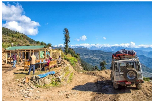
Descent to Rapcha via the new track

The village has undergone other important developments in the field of education and health, thanks to the contribution of our association, which has helped to build schools and set up a dispensary .