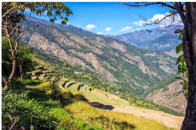
Terraced farming near Rapcha above the Dudh Khosi

The village has only been accessible by jeep since the end of 2017. Until now, the small airport at Phaplu was a 2-day walk away, and the last access point by road was 7 days away.