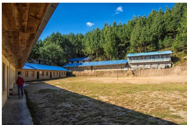
Basakhali secondary school (November 2017)

The village has undergone other important developments in the field of education and health, thanks to the contribution of our association, which has helped to build schools and set up a dispensary .