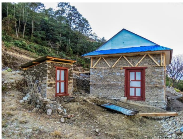
Earthquake-proof house and toilet built in January 2019

With the help of ENSAL (Ecole Nationale Supérieure d'Architecture de Lyon) and the IUT de La Rochelle (civil engineering), the association proposed rebuilding the stone and wood houses using an earthquake-resistant process that allows local materials to be used and reused. In 2017-2018, in conjunction with a technical partner CAPA (Construire et Agir par l'Architecture), a booklet with sketches was produced on this process incorporating traditional practices. Six parasitic houses have been rebuilt in Rapcha. The ANUVAM association provided financial assistance of €4,000 per house and the logistical support of a French building technician. ANUVAM is also continuing its preventive health work, providing €60 for the construction of an outdoor cooking stove for families living in the area, to prevent harmful lung problems.