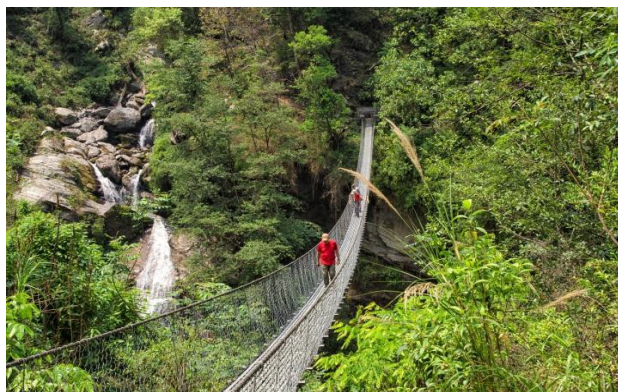
The metal bridge built in 2009

ANUVAM succeeded in having a bridge built over the river to open up the village. In addition to these concrete achievements cultural activities, publications on the traditions of the Khaling Rai ethnic group and the organisation of solidarity trekking tours.