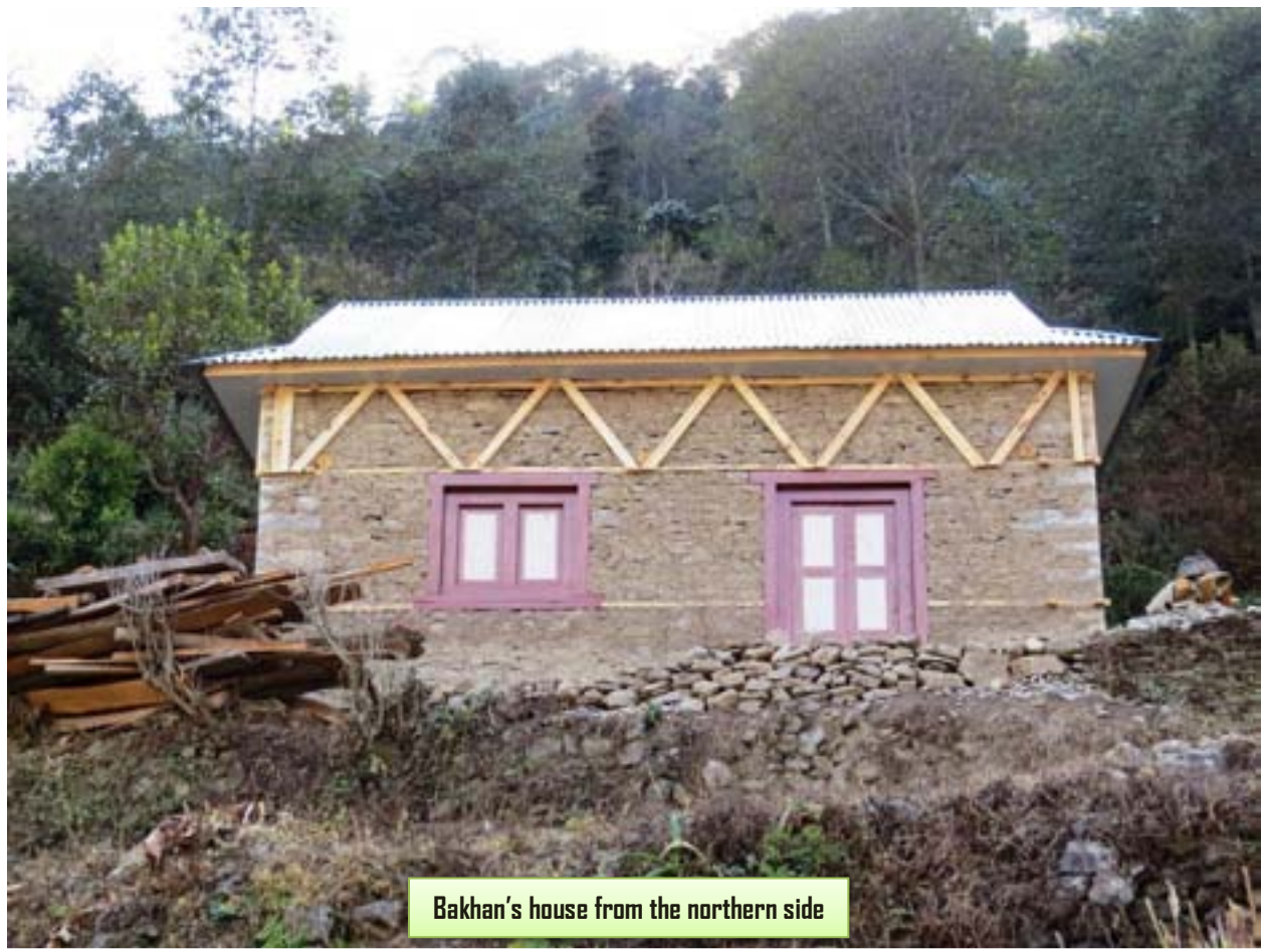
Bakhan's house from the northern side