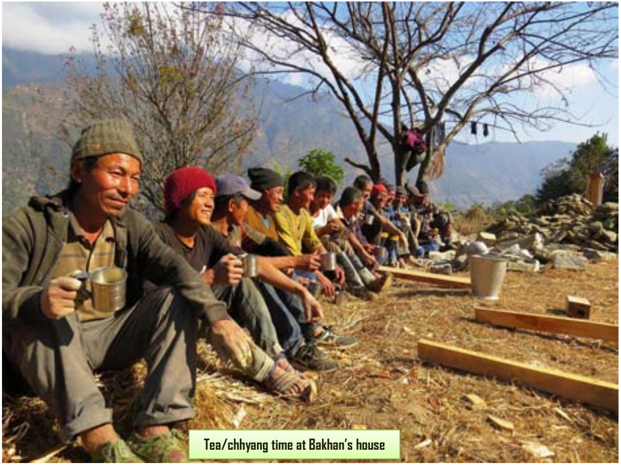
Tea/chhyang time at Bakhan's house

14 workers had worked in this house and it took 210 workers to complete the house.