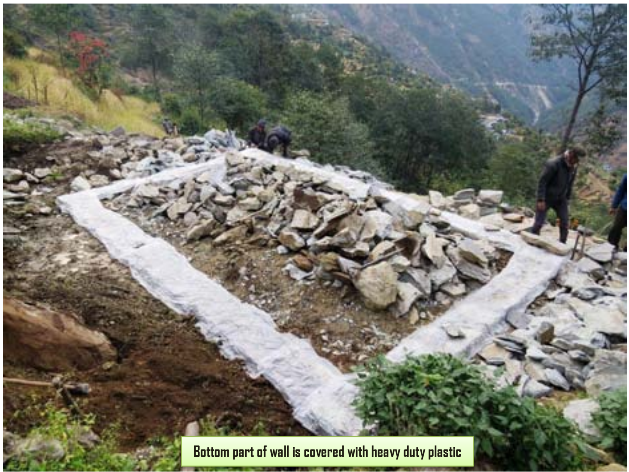
Bottom part of wall is covered with heavy duty plastic

It was a difficult decision made in difficult situation. Sarke's family does not have much land, let alone a proper flat land where they could build their house. The old house belongs to his elder son, and at the adjacent was this small open land where we built Sarke's family's house. The construction area is somehow wet most of the time of year, so we decided to put a heavy duty plastic layer below the first seismic bend so that the bend is protected from water coming up via the walls from the ground.